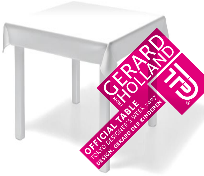
Clothtable selected as Official Table Tokyo Designer's Week 2007

www.gerardderkinderen.nl www.gerardfromholland.com